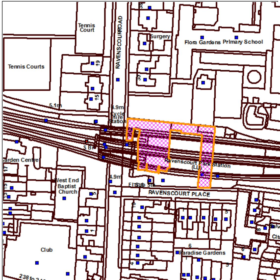
London Borough Hammersmith and Fulham LA100019223 (2013). For identification purposes only - do not scale.

101 And 105 - 107 Stamford Brook Arches Ravenscourt Place London W6 0UQ